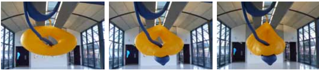
INF 14, 2012, 13.5 x 5.4 x 3.6m